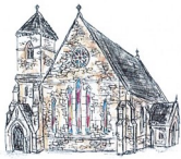
ST. JAMES THE LESS