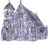
ST. JAMES THE LESS