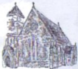
St. James the Less